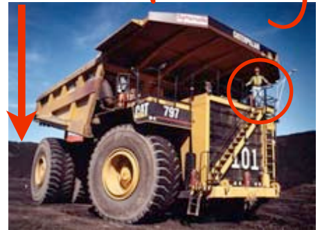
CAT 797s, used in oil sands surface mining, are one of the world's largest trucks.