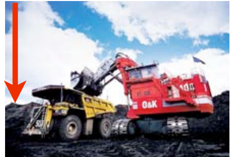
Hydraulic shovels load bitumen onto the trucks. The bitumen is taken to the extraction plant for processing.