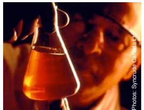
The finished product—high quality, light sweet crude oil.