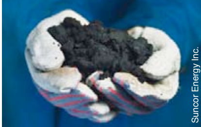
Suncor Energy Inc.

Different phases of an upstream oil sands project need different kinds of workers. For more in-depth information about the job categories here, visit the Petroleum Human Resources Council of Canada ( petrohrsc.ca ), the Centre for Energy ( centreforenergy.com ) or careersinoilandgas.com .