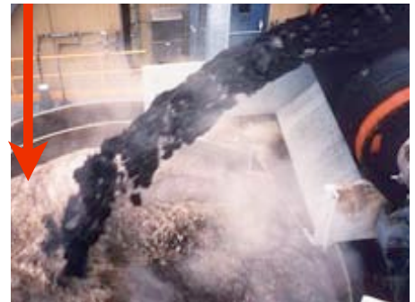
Oil sand is processed in the extraction plant.